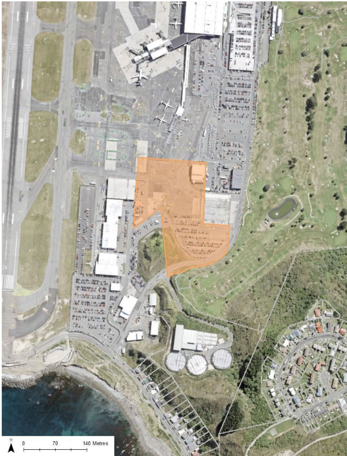
Engine Testing Exclusion Area