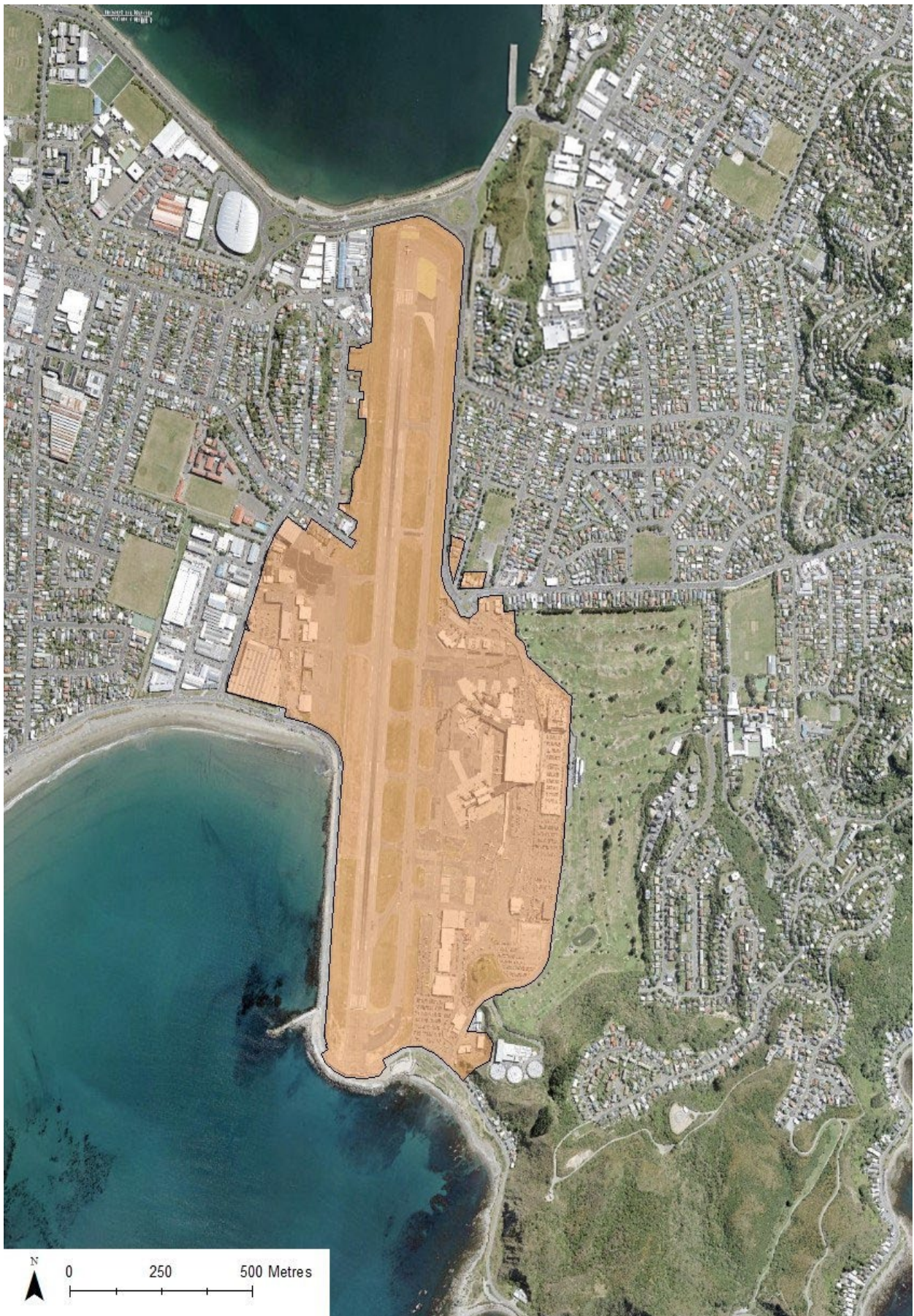
Airport Purposes Designation Boundary