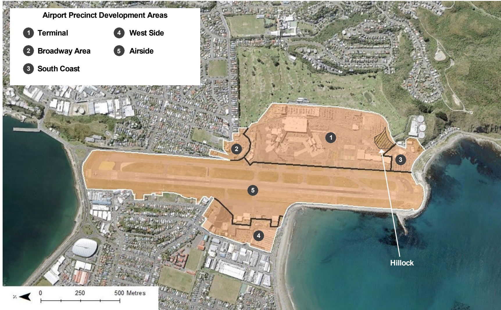
Airport Precinct Development Areas